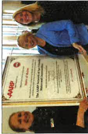
State of Maine

Learn how your town, village, township, borough, city, county or state can join the AARP Network of Age-Friendly States and Communities . AARP.org/AgeFriendly