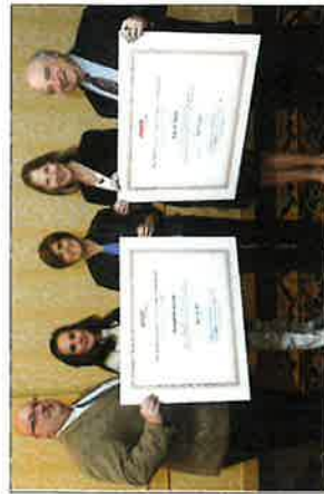
Ithaca and Tompkins County, New York