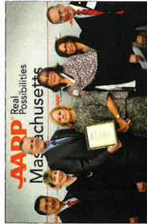
Commonwealth of Massachusetts

See the complete list of enrolled communities: AARP.org/AgeFriendly-Member-List