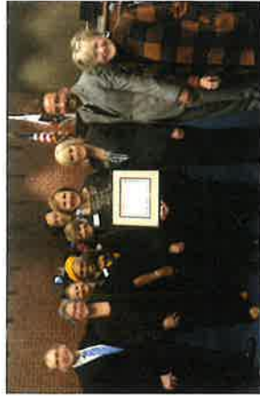
San Rafael, California