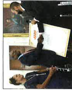
U.S. Virgin Islands