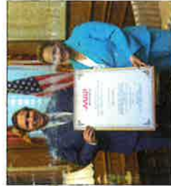
State of Florida